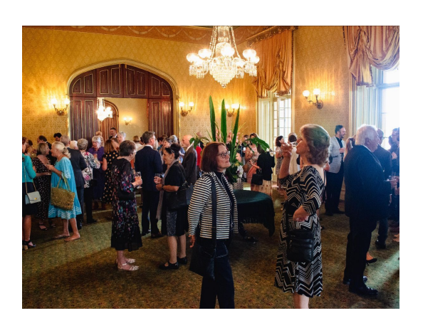
2RPH volunteers and guests