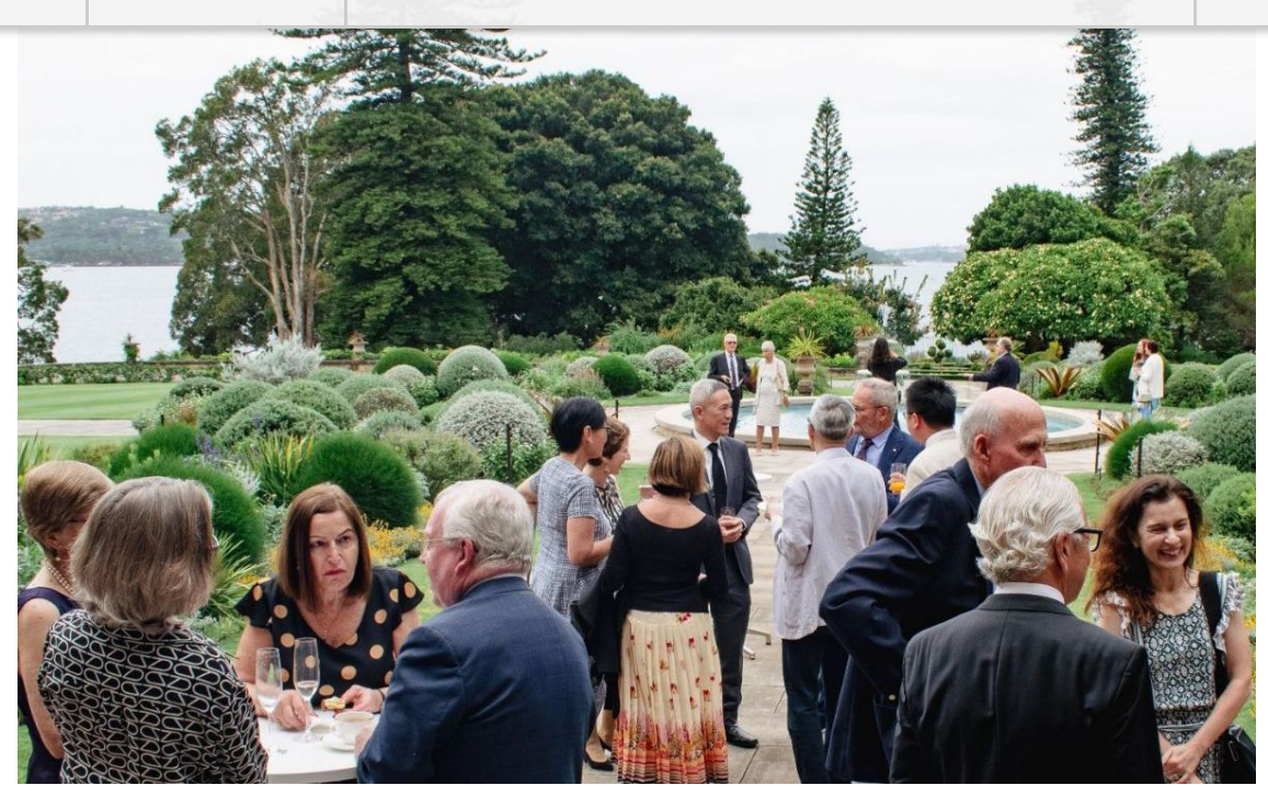
2RPH volunteers, staff and guests in the Government House garden