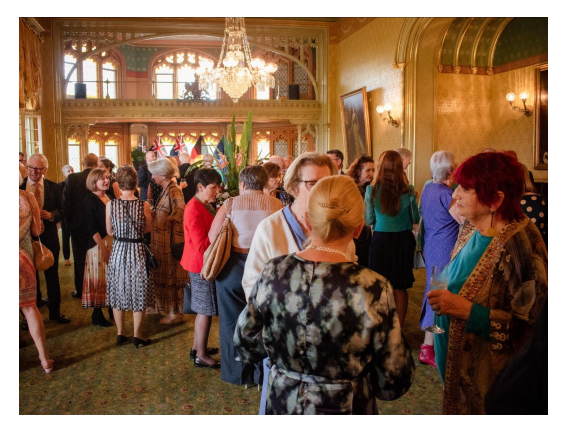
2RPH volunteers and guests