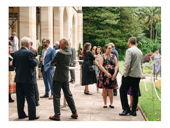
2RPH volunteers and guests